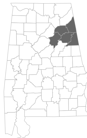
THE GSCC SERVICE AREA, AL