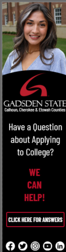
CLICK HERE 160 x 600