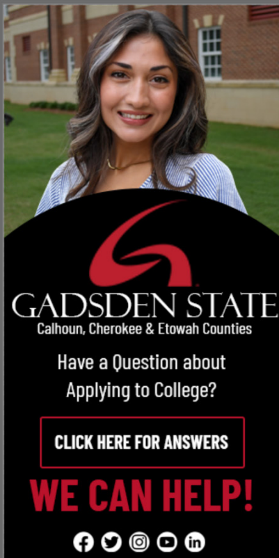
CLICK HERE 300 x 600