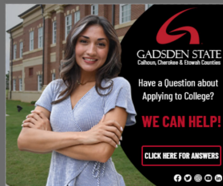
CLICK HERE 336 x 280